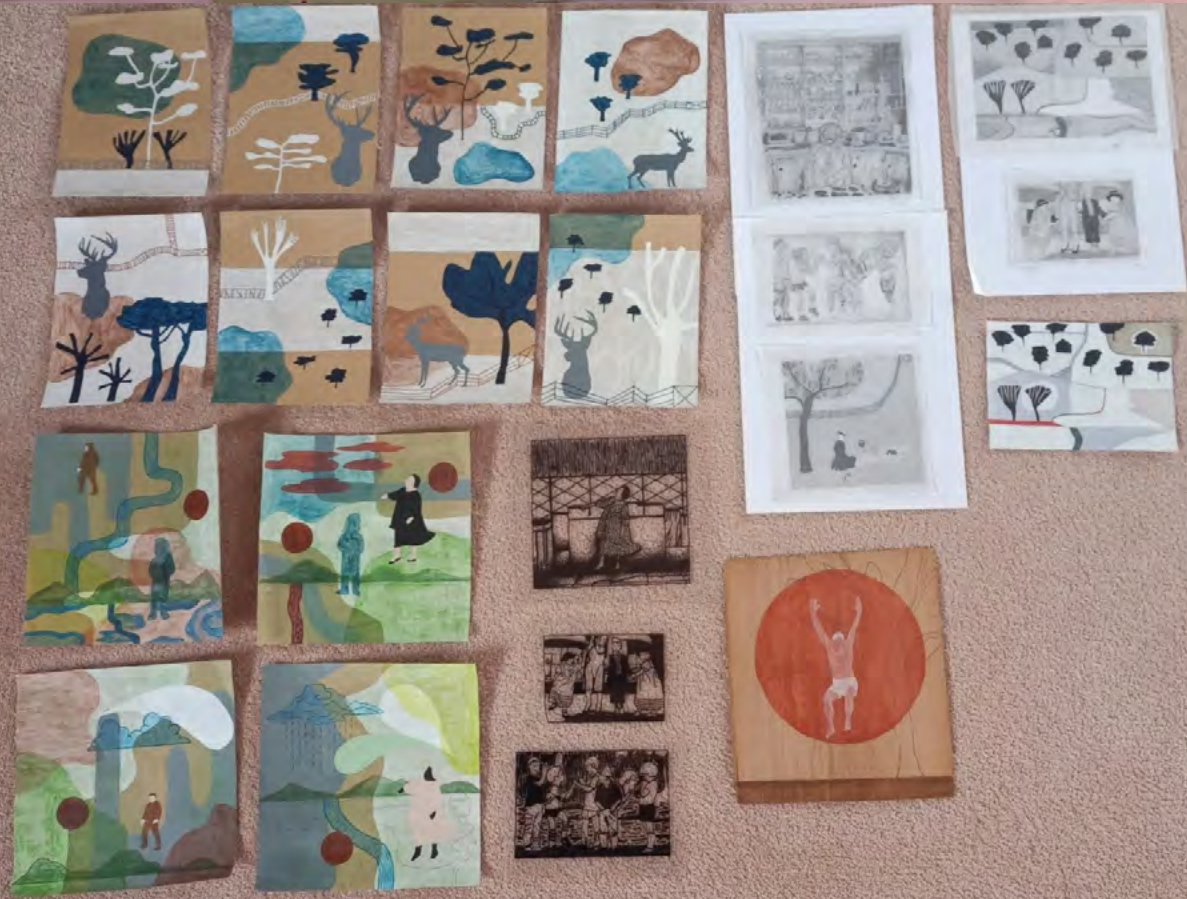
ALYSSA BAXTER 12CW