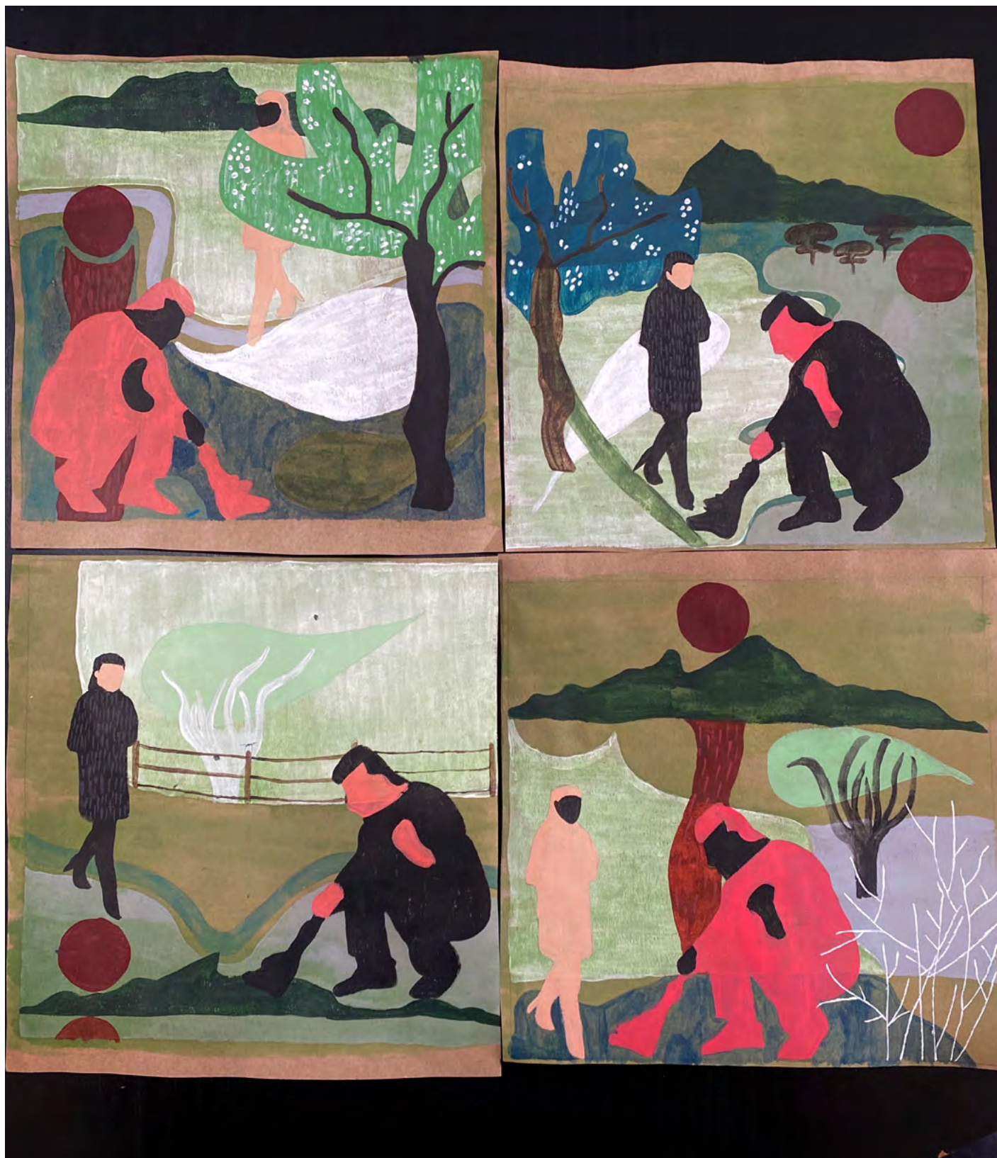
NELLIE-EVA SIFAHEONE 12MX