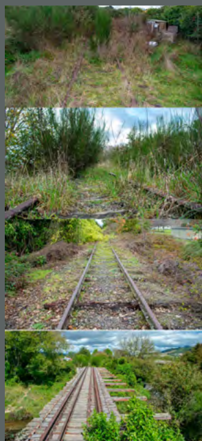
OSBOURNE ROZAS 13TY