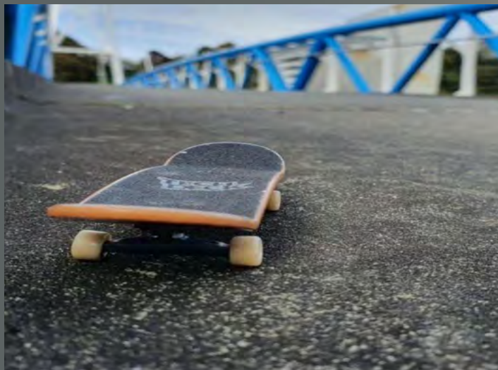
OTIS CREAGH-LESLIE 10LL