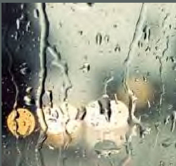
ALYSSA HUGHES 10WO