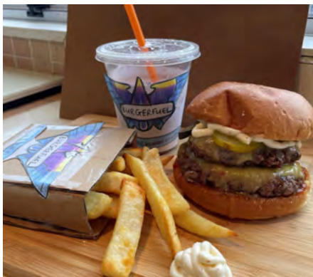
1st ALEX EASTWOOD Burger Fuel