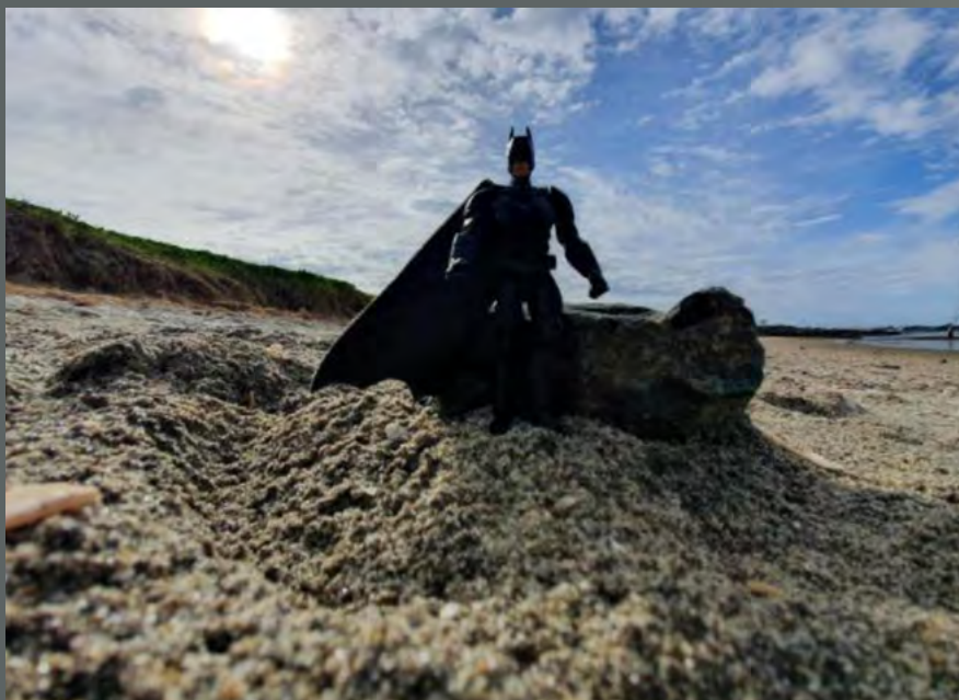
OTIS CREAGH-LESLIE 10LL