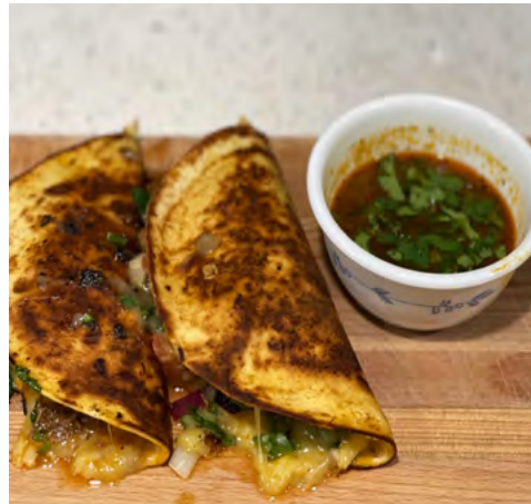
2nd ISAAC NAIR 13BN Beef Birria Tacos