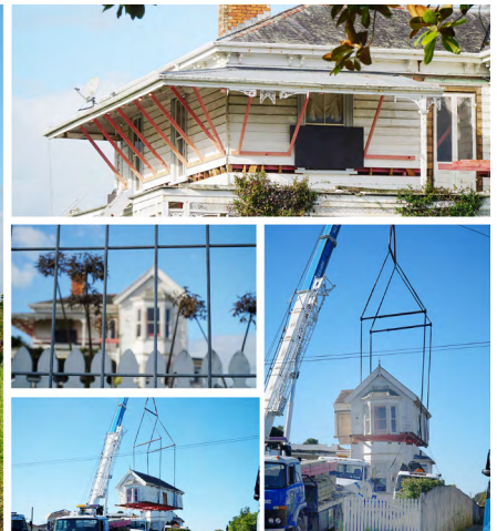
Sjaan Hennessy-Tetteroo 13Bn