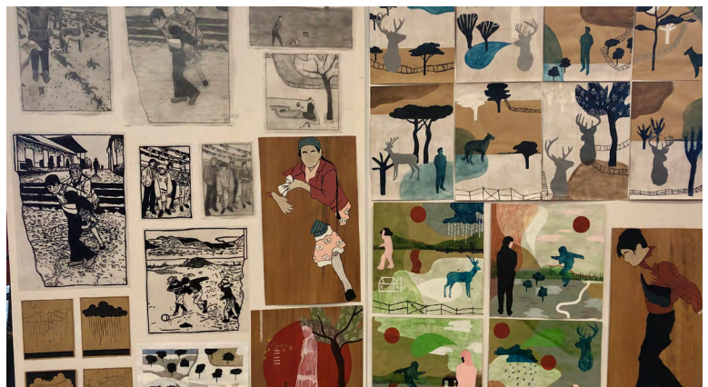
Camryn Lowe 12Rt