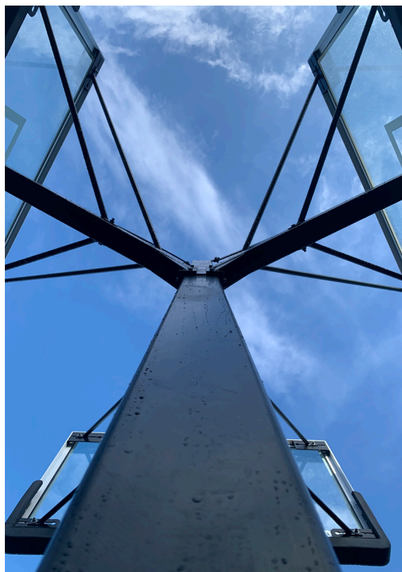
Dallas Repia 10Tn