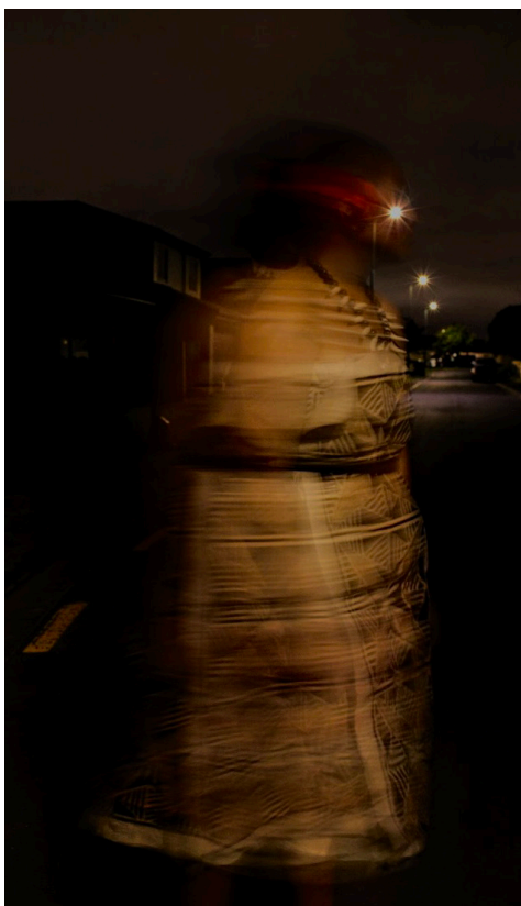
Vaitofiga Anesone 10Ce