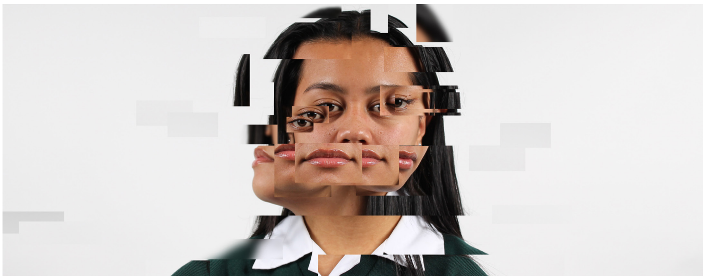
First Wongwai 11Ps